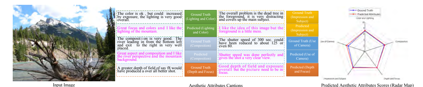
Figure 1: Aesthetic Attributes Assessment of Images. We predict caption and score of each aesthetic attribute of an image.

Department of Cyber Security, Beijing Electronic Science and Technology Institute, Beijing 100070, P. R. China